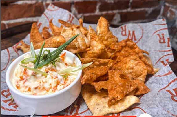
Creamy Rangoon Dip VG

Creamy Sweet Chili Rangoon Dip Served with Crispy Wonton Chips 11.00