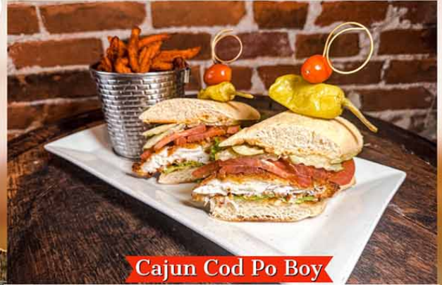
Cajun Cod Po Boy

Creamy Sweet Chili Rangoon Dip Served with Crispy Wonton Chips 11.00