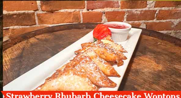
Strawberry Rhubarb Cheesecake Wontons

Roasted Eight Ounce Norwegian Cod Lemon & Herb Almond Crust-Roasted Red Potatoes Creamy Herb Sauce Served on Side Choice of Soup or House Salad 24.00