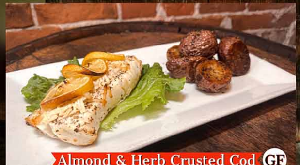
Almond & Herb Crusted Cod GF

Lentil Lasagna with layers of Roasted Greek Eggplant Creamy Bechamel Sauce-Melted Cheeses Choice of House Side and Soup or Salad 18.00