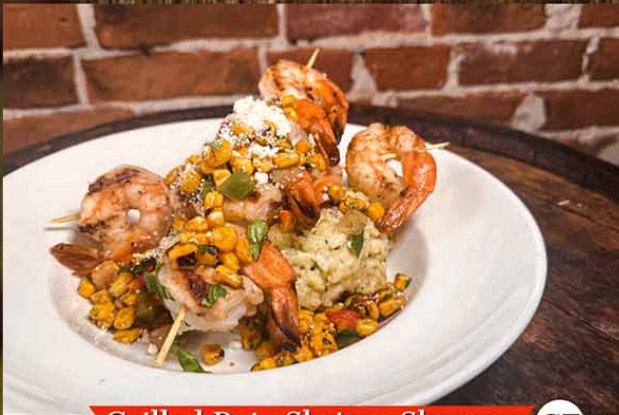
Grilled Baja Shrimp Skewers GF

Crispy Fried Norwegian Cod-Shredded Lettuce Tomato-Dill Pickle-Cajun Remoulade on side Toasted Hoagie-Choice of One House Side 16.00